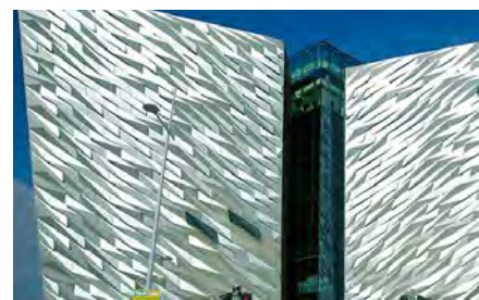
The Beautiful Titanic Museum