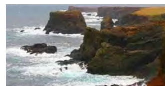
panoramic North Shetland & Eshaness Cliffs

See the next page for more details about the exciting ports of call!