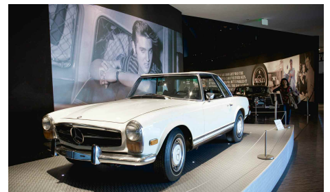
Graceland

Visit to Graceland includes Elvis Presley's original business office, collection of gold records and awards, costumes, automobile museum, "Graceland of the Sky" private jet, and Presley family Meditation Garden. Farewell dinner at the famous Rendezvous BBQ restaurant this evening. (B, D)