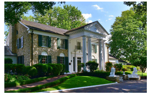
Graceland

MEMPHIS Visit to Sun Studios and the Rock 'n' Soul Museum. Free time this afternoon and evening. (B)