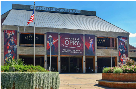
Grand Ole Opry

Welcome to Nashville! At 6 pm, meet your Tour Director and traveling companions for a welcome drink.