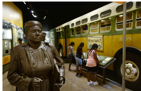
National Civil Rights Museum

Guided sightseeing with a Local Guide. Guided visit to National Civil Rights Museum. Dinner at a local restaurant this evening. (B, D)