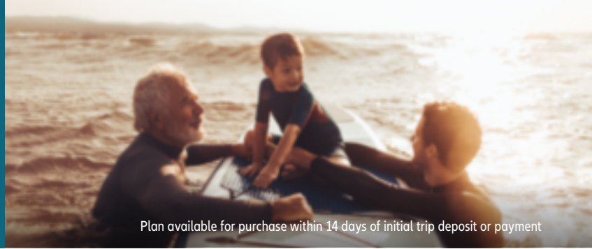
Plan available for purchase within 14 days of initial trip deposit or payment

Whether you're planning a solo adventure or a grand, multi-generational getaway, the whole point is to relax and enjoy your trip. Allianz Travel Insurance gives you the confidence to focus on the experience, knowing you are protected against many common travel mishaps and emergencies by a reputable company with a global network and award-winning customer service.