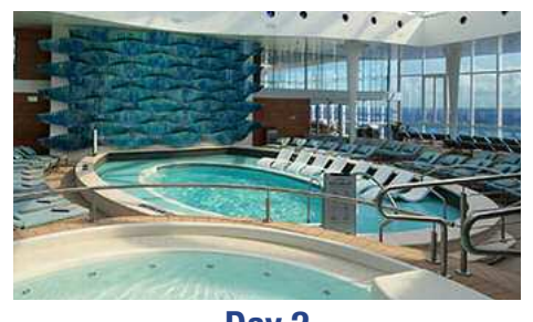
Day 2 At Sea Cruising Sun. Sept. 29, 2024

Athens brought the world drama, history, poetry, and philosophy. Once home to the world's most powerful and civilized empires, Athens is now the world's foremost archaeological playground. The towering columns of the Parthenon still stand in homage to the virgin goddess Athena. The Parthenon sits atop the Athenian Acropolis and watches over the city where it can be seen from just about anywhere in Athens. In addition to an abundance of historical riches, modern Athens has plenty to offer—from scenic beaches to restaurants with superb Mediterranean cuisine and bustling markets.