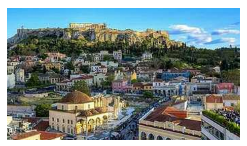
Day 1 Athens (Piraeus), Greece

Unpack only once and visit 7 unique destinations in comfort, convenience and ease on this extraordinary voyage! You may come and go in each port of call or take advantage of a wide variety of optional shore excursions designed to incorporate highlights of the areas.