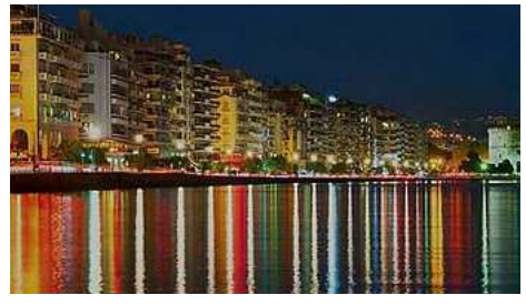
Day 7 Thessaloniki, Greece Fri. Oct. 4, 2024

Volos, Greece's newest port city, is located at the foot of Mount Pelion and the innermost point of the Pagasetic Gulf. As an important industrial center and bridge between Europe and Asia, this lively seafront destination offers you many things to discover—local cultural activities, museums, cafes, restaurants, and an exciting nightlife area. You will also enjoy its unique architecture, nearby lush mountain ranges, and golden beaches.