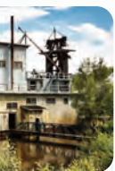
Dredge #8 Tour