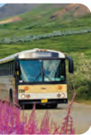
Al History Tour